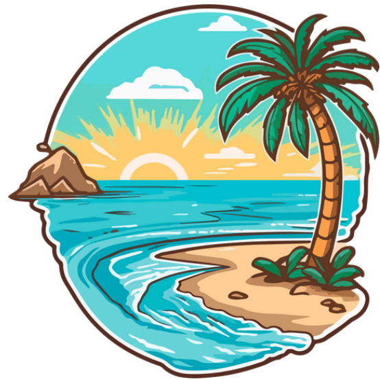
Stops at João Fernandes and Fernandinho Beaches