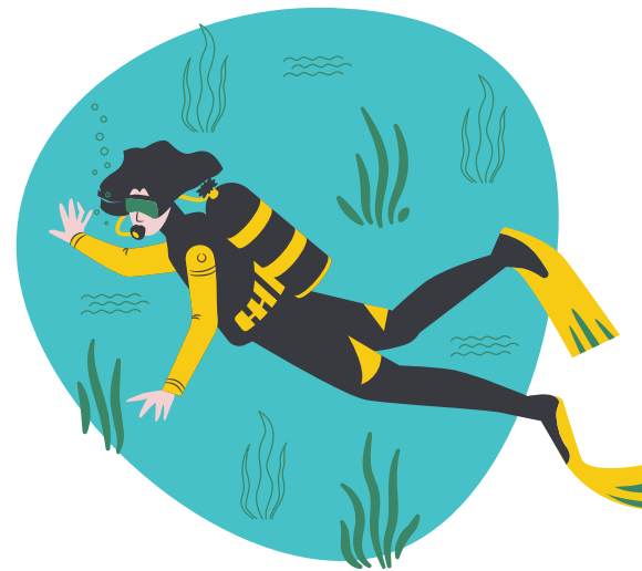
Scuba diving opportunities with trained instructor