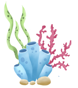
Coral Oark (Parque dos Corais)