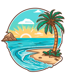
Multiple Beach and islands Stops