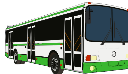
Roundtrip transportation in air-conditioned vehicle