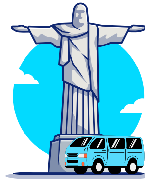
Christ the Redeemer and Corcovado mountain by van