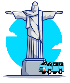
Christ the Redeemer (by van)