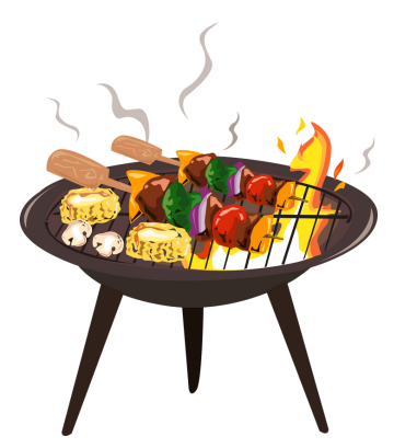
Traditional Brazilian BBQ lunch