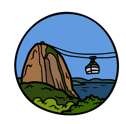
Sugaloaf by cable car