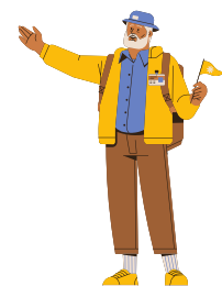
Multilingual guided tour in English, Spanish and Portuguese