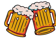
Bohemia Brewery Tour