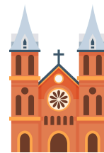
São Pedro de Alcântara Cathedral