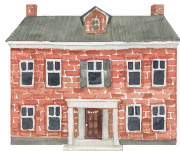
Santos Dumont's House