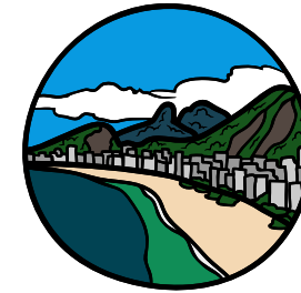
Copacabana, Leblon and Ipanema Beach