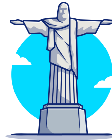
Christ the Redeemer