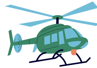
Thirty minute helicopter flight