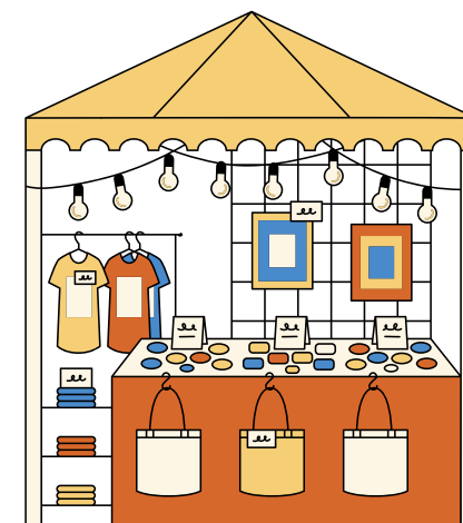
Farmer's and artisan's market