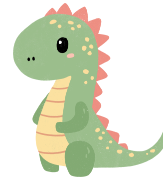
Life sized dinossaur models