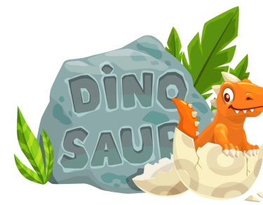
Day at Miguel Peireira park "Dino Land"